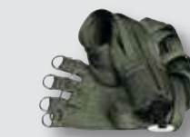
IT top connection